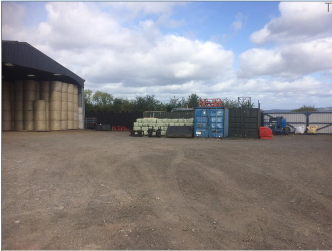
Containers 11 – 13 looking NW