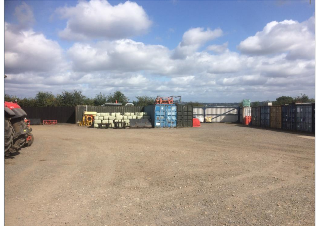
Containers 11 – 13 looking North