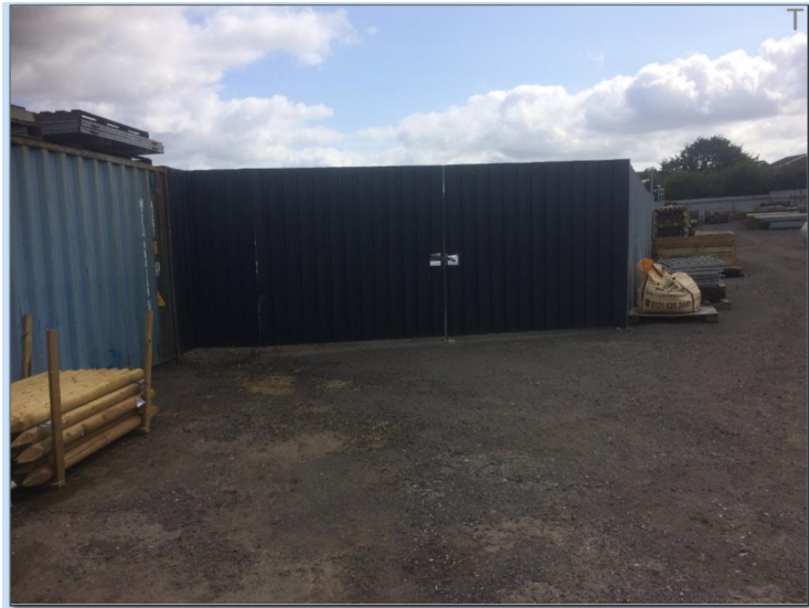
Compound entrance looking East