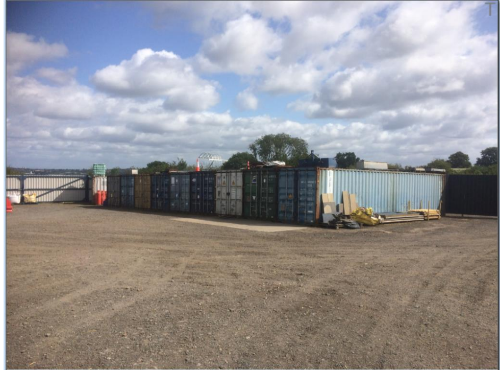
Containers 1 – 10 looking NE